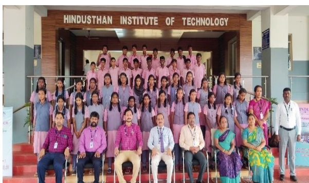
Fig:18. Snapshot of Students' Educational Visit to College