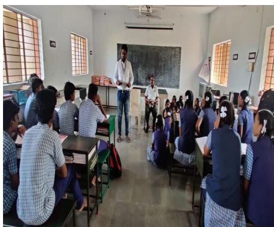
Fig:15. Snapshot of Project Orientation talk with Resource Persons