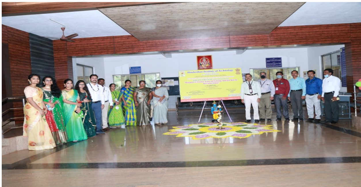
Fig: 4. Announcement Flex