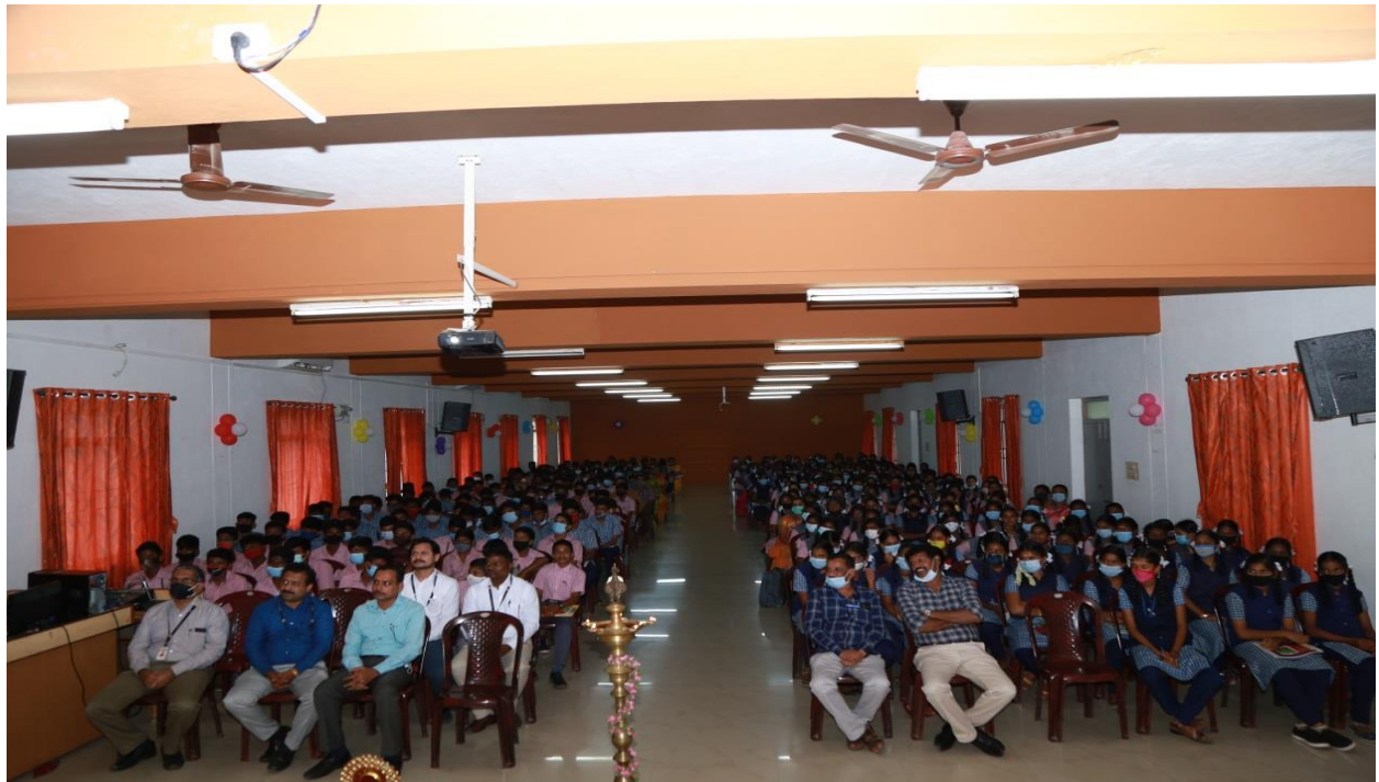
Fig.13. Students Gathering & listening to the Addresses