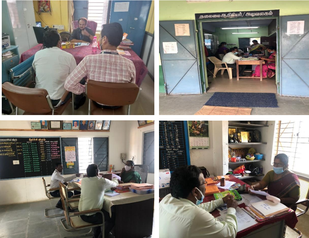
Fig:3. Snapshot of PI & CO-PI Meeting with Government School Principals