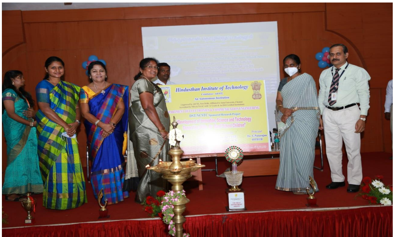
Fig.14. Unveiling the Project Souvenir