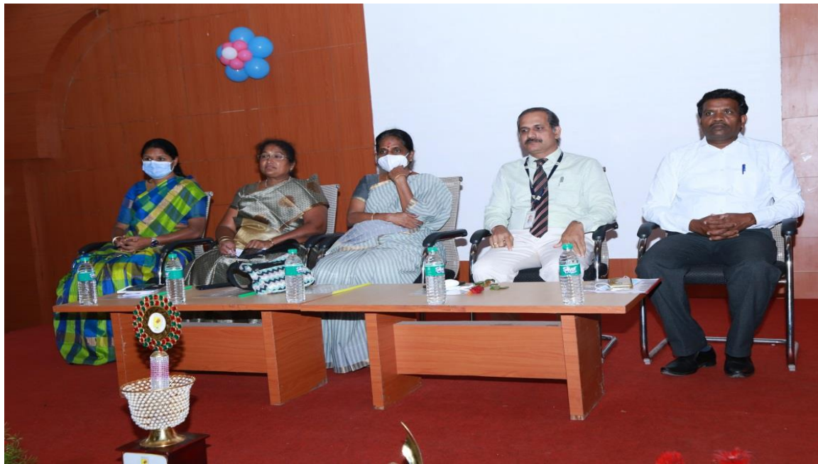
Fig.9. Dignitaries on the Dias