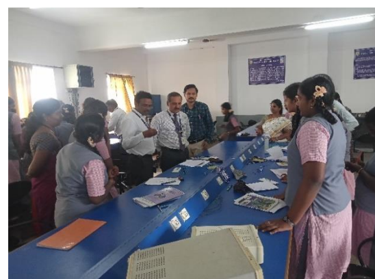
Fig:16. Snapshot of Training Cum Demonstration