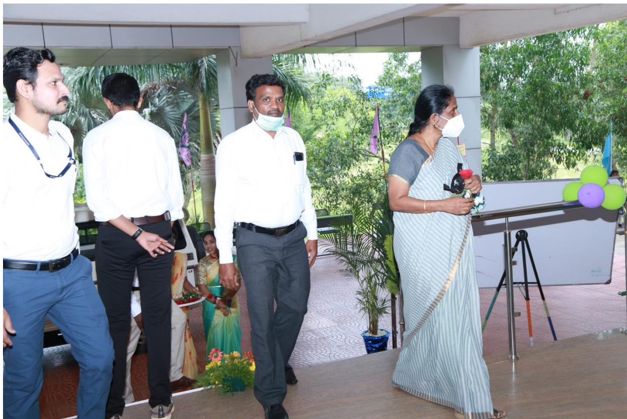
Fig.5. Chief Guest Arrival