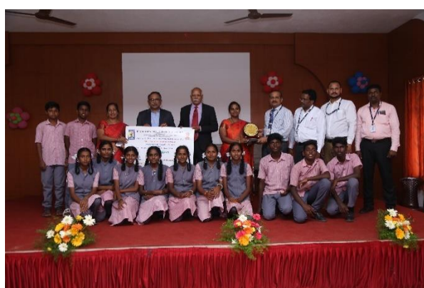
Fig:19. Snapshot of Project Expo and Valedictory Session