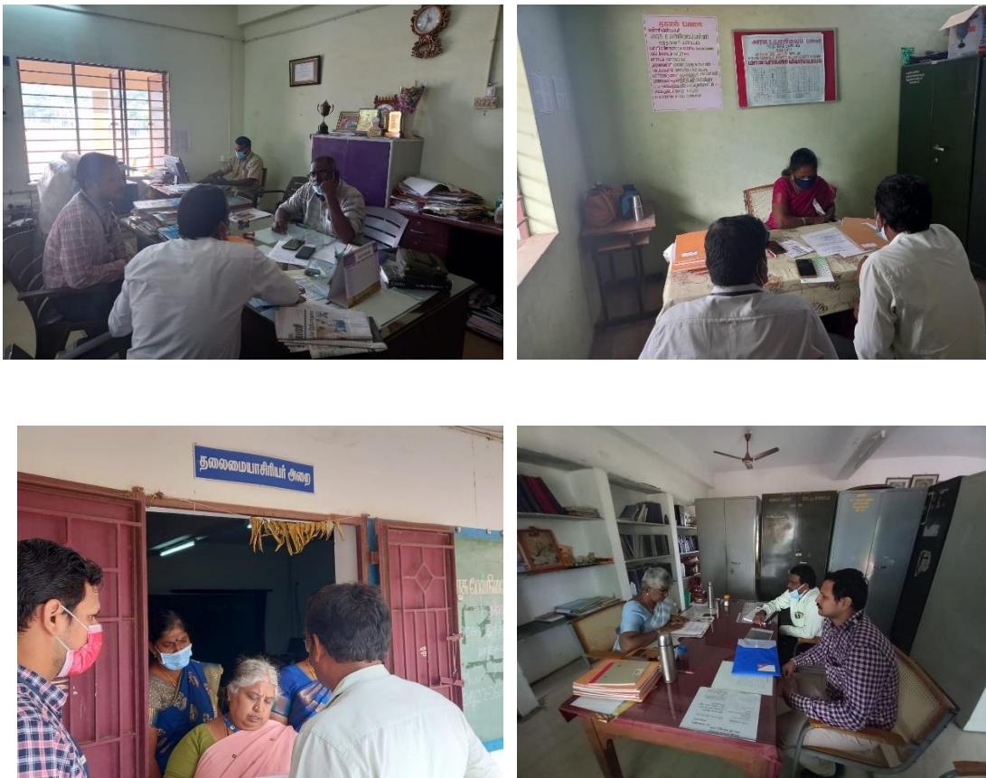
Fig:2. Snapshot of PI & CO-PI Meeting with Government School Principals