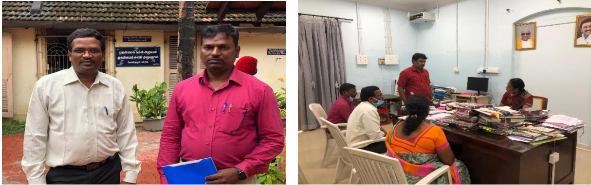
Fig:1. Snapshot of principal Investigator and Co-Principal Investigator discussion with CEO, Coimbatore