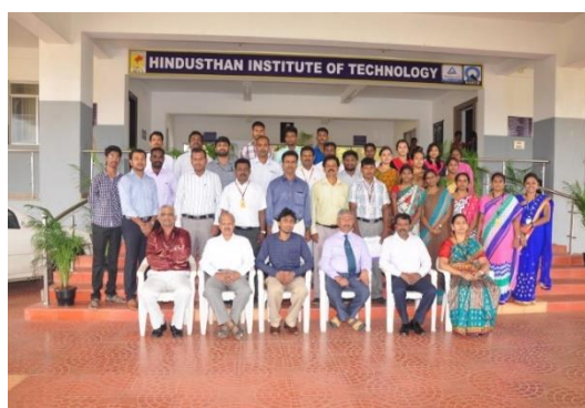
Fig:17. Snapshot of Motivational Programme for School Teachers